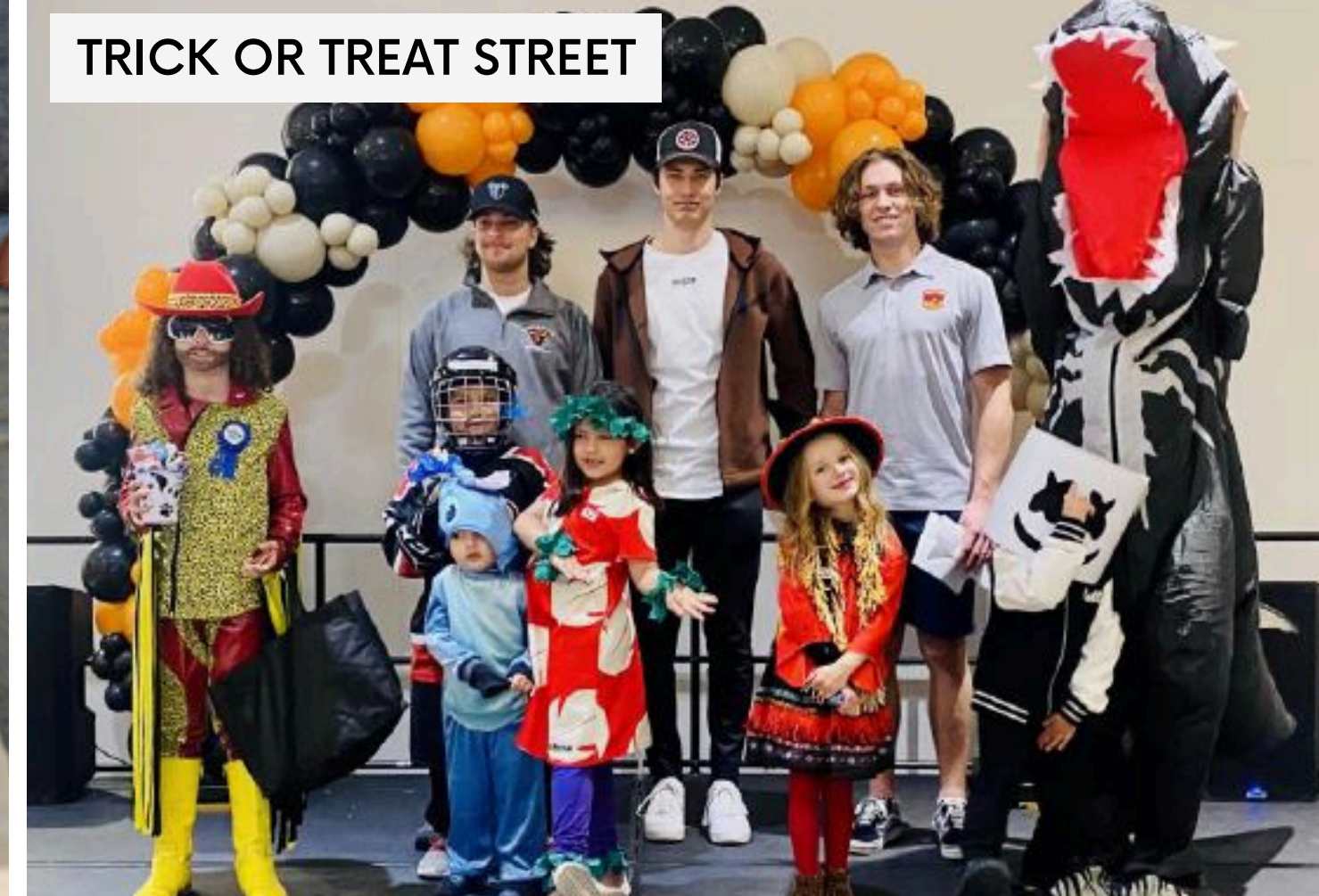
TRICK OR TREAT STREET

MORE THAN 50 EVENTS EACH YEAR WITH THOUSANDS OF ATTENDEES