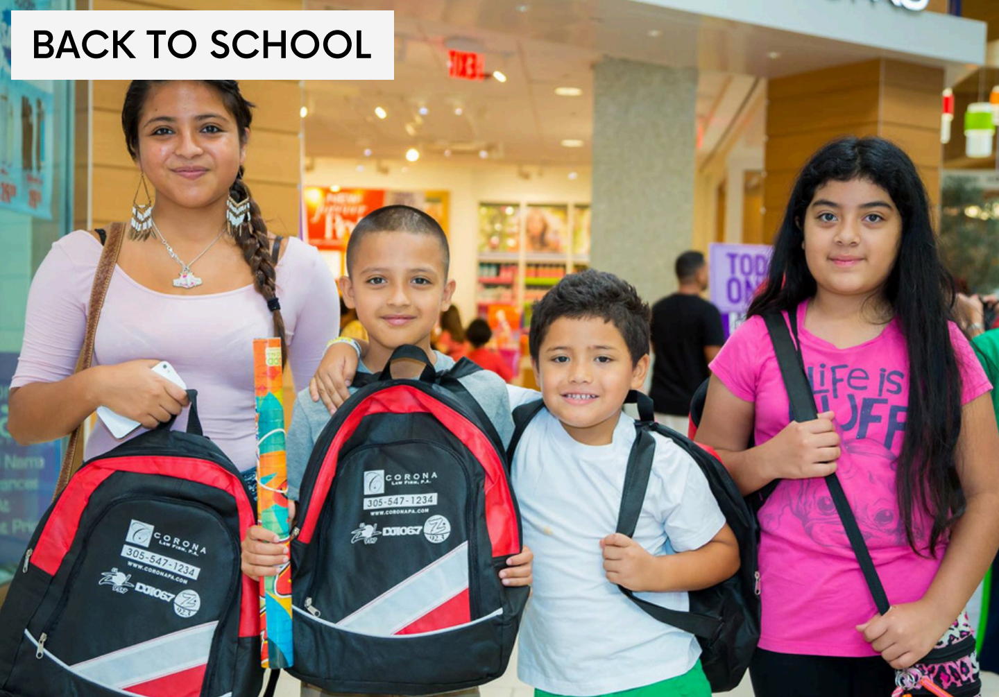
BACK TO SCHOOL