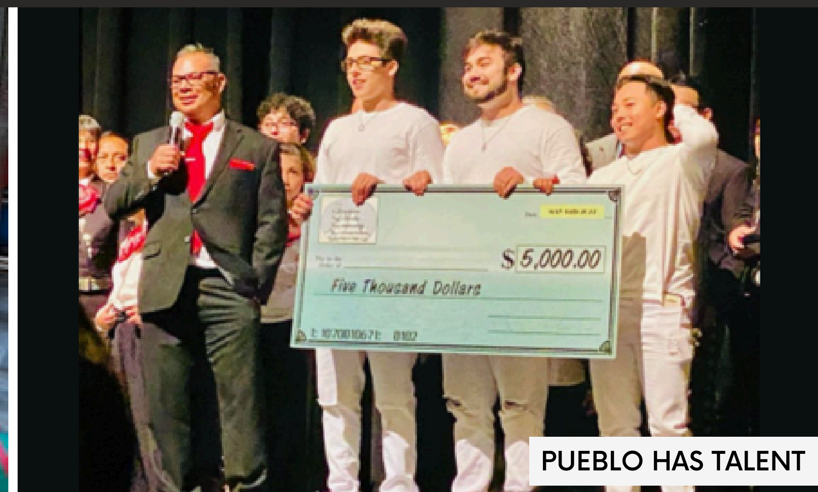
PUEBLO HAS TALENT