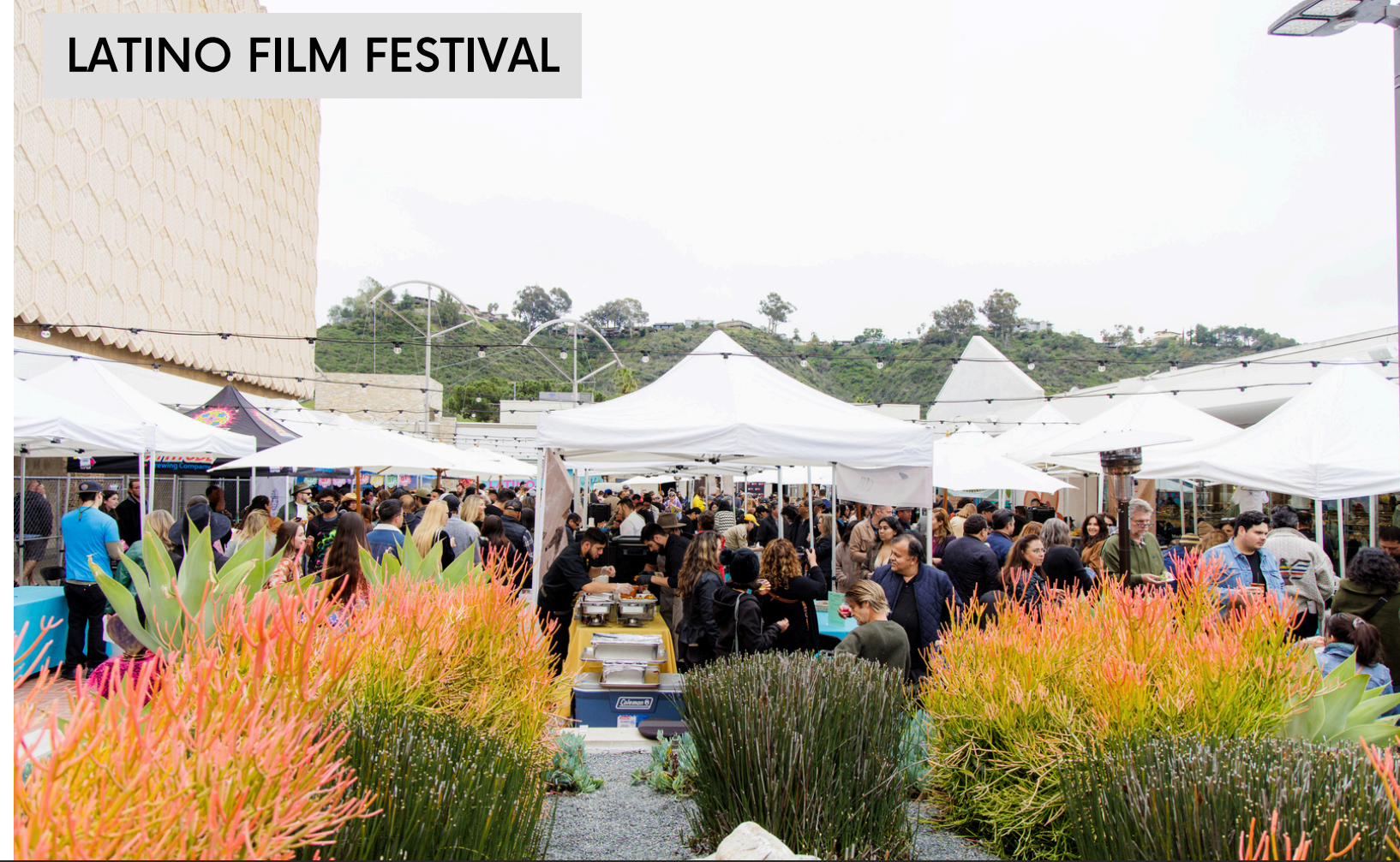
LATINO FILM FESTIVAL

MORE THAN 15 EVENTS EACH YEAR WITH THOUSANDS OF ATTENDEES