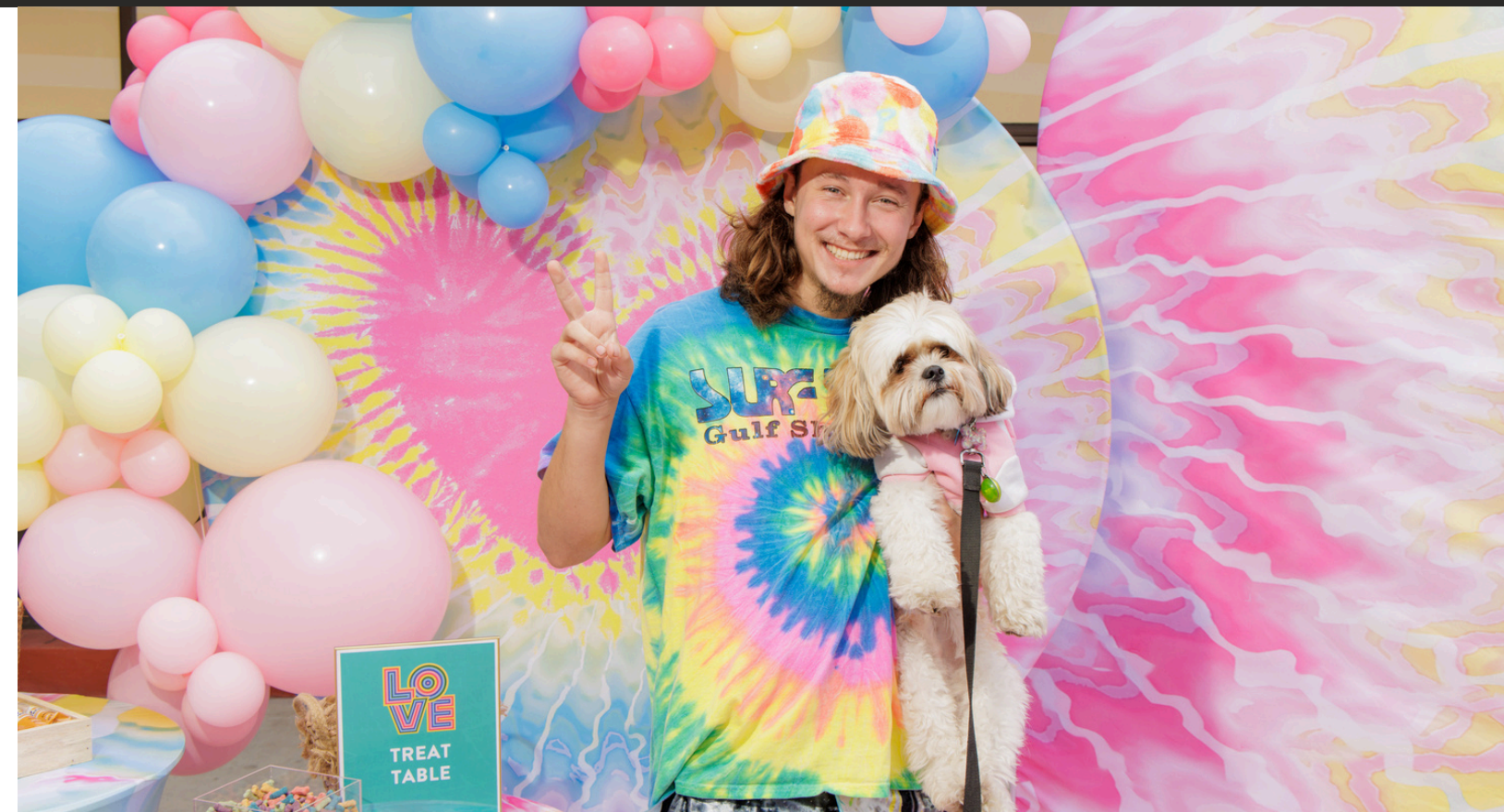
PRIDE DOG FASHION SHOW