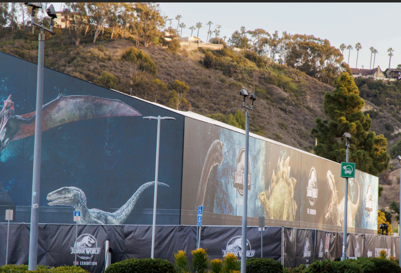
JURASSIC WORLD: THE EXHIBITION

MORE THAN 15 EVENTS EACH YEAR WITH THOUSANDS OF ATTENDEES