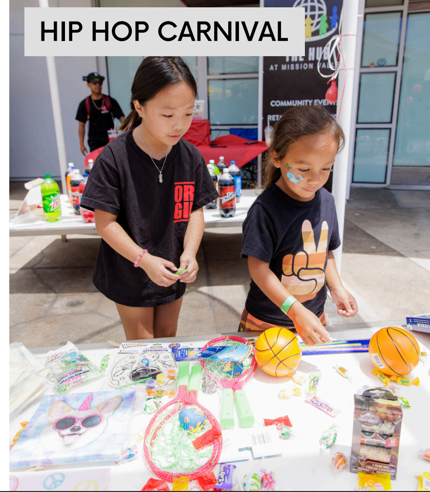
HIP HOP CARNIVAL