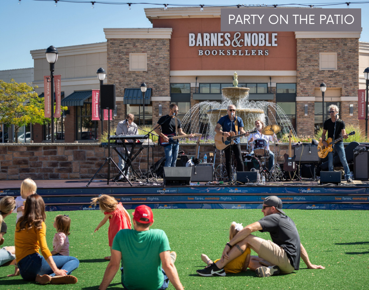
PARTY ON THE PATIO