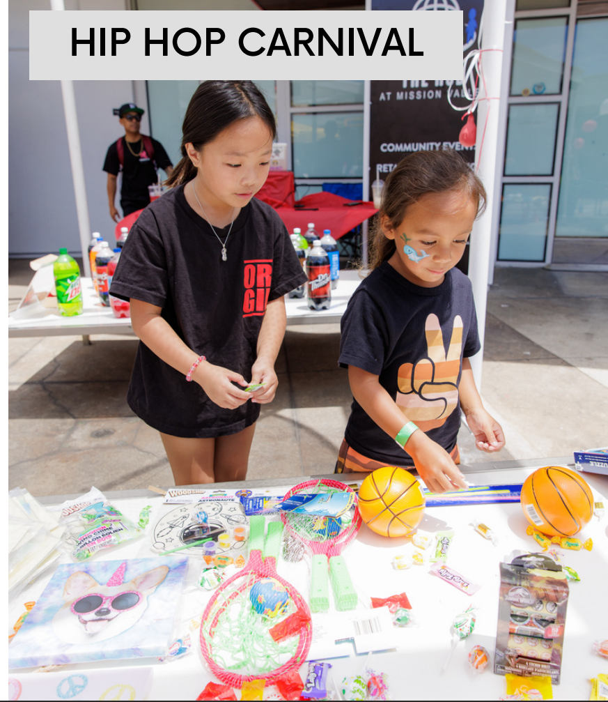
HIP HOP CARNIVAL